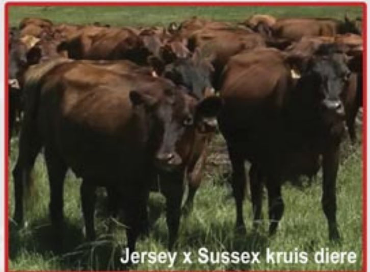
Jersey x Sussex kruis diere

Sussex bulls are used on milk herds with great success. The calves are reared by dairy farmers and when they reach weaning they are introduced into the commercial beef herds. Dairy breed cross animals have the ability to put on beef and weight with the added benefit of increased milk production.