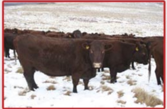
ADAPTABLE - COLD