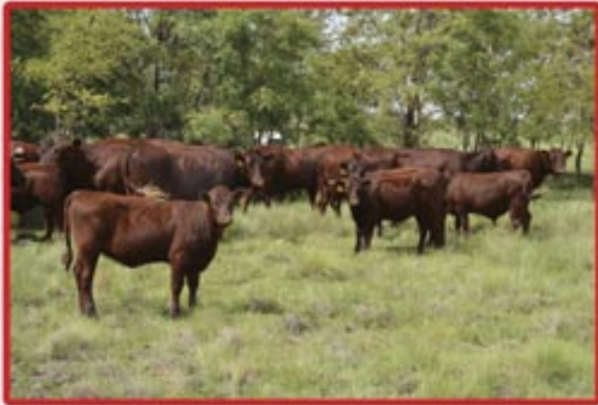
AANPASBAARHEID - WARM/DROOG

THE SUSSEX CATTLE ARE A DOCILE MEDIUM SIZED, EARLY MATURING BEEF BREED AND WELL ADAPTED IN TODAY'S NARROW MARKET REQUIREMENTS AND STRINGENT ECONOMIC CLIMATE